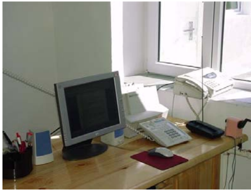
Access to: Telephone, Fax Internet, and E-Mail