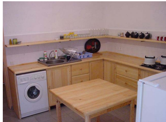
Kitchen, Laundry Services available

Prices*: 25 € Single Room: with grand opening discount now only 20 €