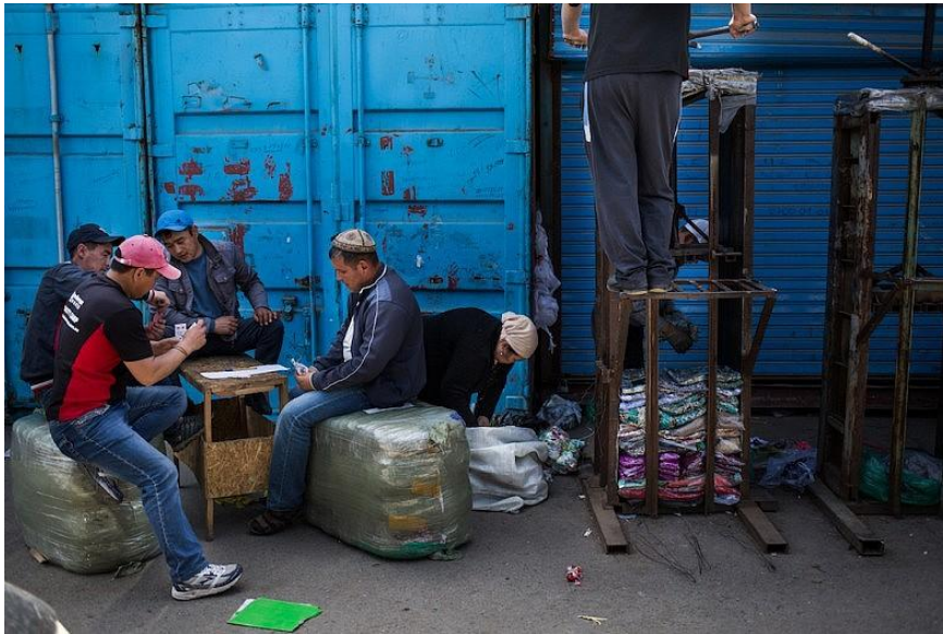
Packaging workers playing cards. There is no work, they say.

While the government's line was contested by those who viewed the EEU as an economic Trojan horse to advance Russian President Vladimir Putin's political ambitions to reassert Russia's influence in its former Soviet periphery, the lesser-of-two-evils argument won out in the end, as many concluded that the risks of membership were outweighed by those of non-membership. Simplified procedures for the hundreds of thousands of Kyrgyzstani seasonal laborers working in Russia and Kazakhstan also played a major role in the decision to join.