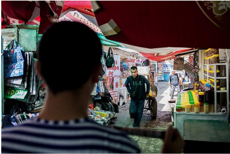
Porters at Dordoi market

Nowadays, it is very common to hear such complaints from traders at Dordoi, a sprawling market of crisscrossing lanes with double-stacked containers serving as both storage and shop, located on the northeastern outskirts of the Kyrgyz capital Bishkek. Once a thriving hub for the re-export of mostly Chinese and Turkish goods on to former Soviet Republics, Dordoi has been experiencing severe difficulties of late in the wake of Russia's economic downturn, itself the result of plummeting oil prices and Western sanctions linked to the Ukraine conflict, to which the Kremlin has responded with its own set of counter-sanctions.