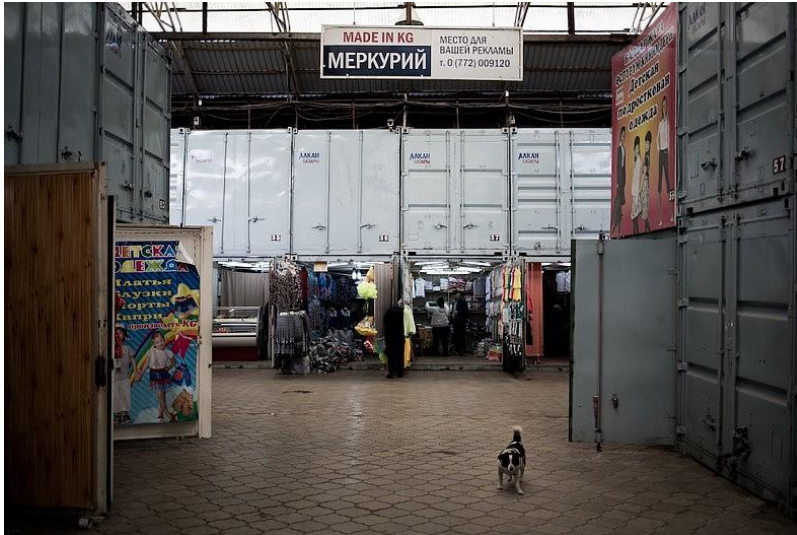
Dordoi market. Made in Kyrgyzstan.